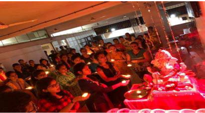
4th YR (OLD COURSE) STUDENTS CELEBRATED "GROUP DAY