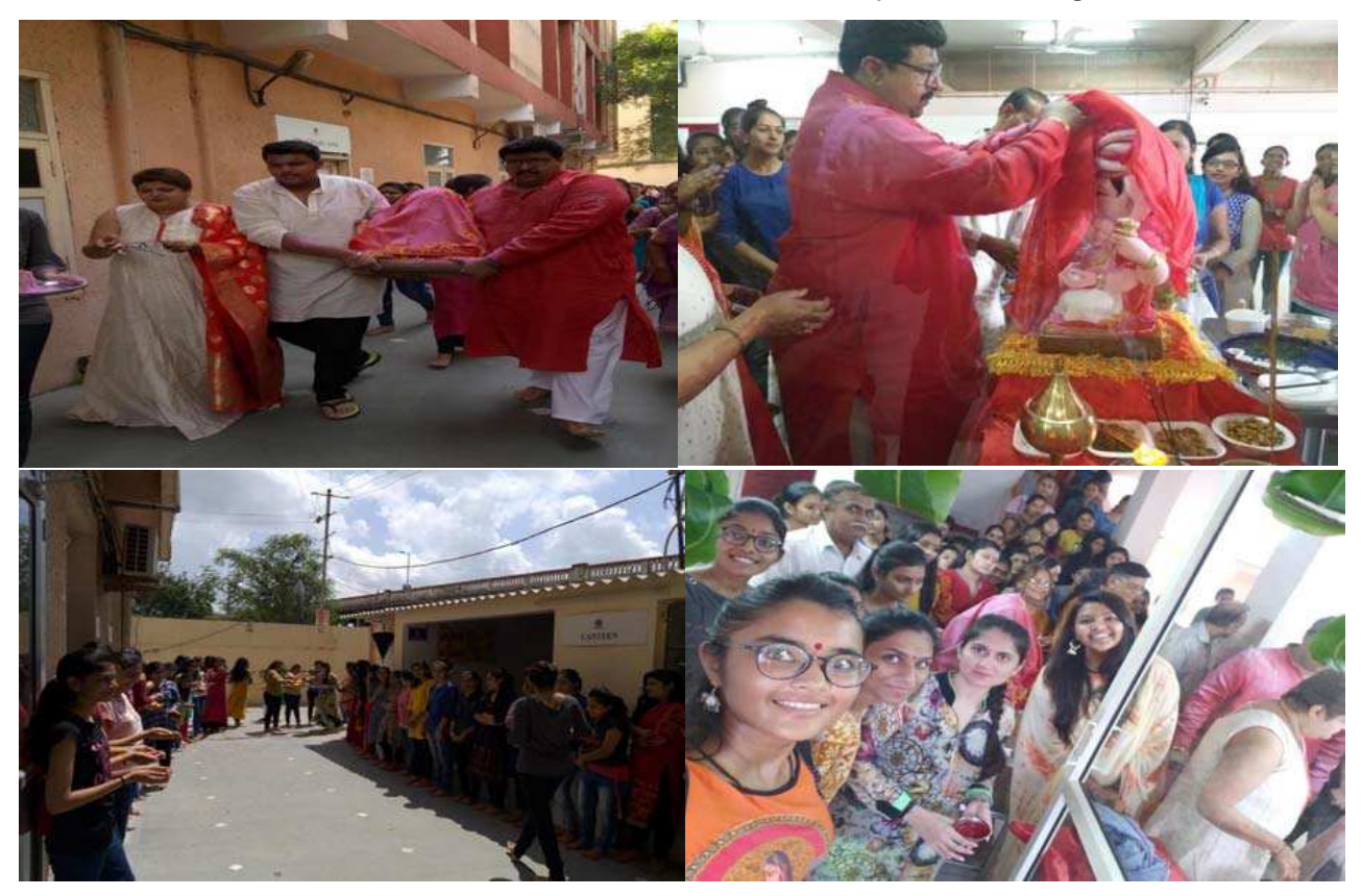
14/09/2018 4th YR (OLD COURSE) CELEBRATED "TRADITIONAL DAY "@ SMMHMC CAMPUS

The exhilarating 'Ganapati Festival' celebrations began in SMMHMC on pious occasion of Ganesh Chaturthi', with 'Ganesh Sthapana' in college Hostel.